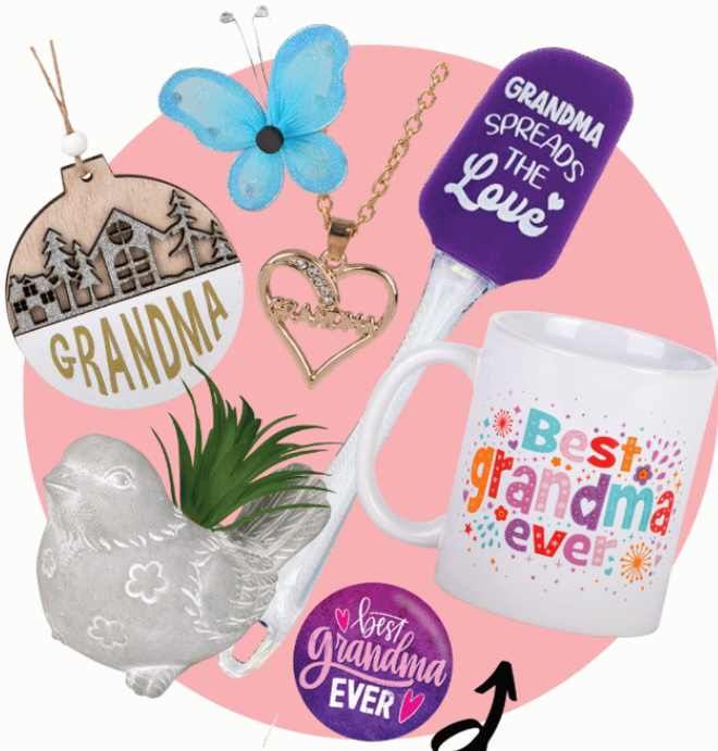
Gifts for Grandma