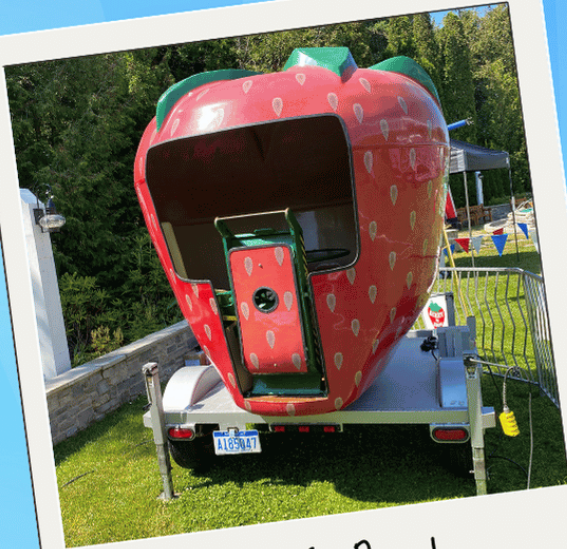
Berry Go Round