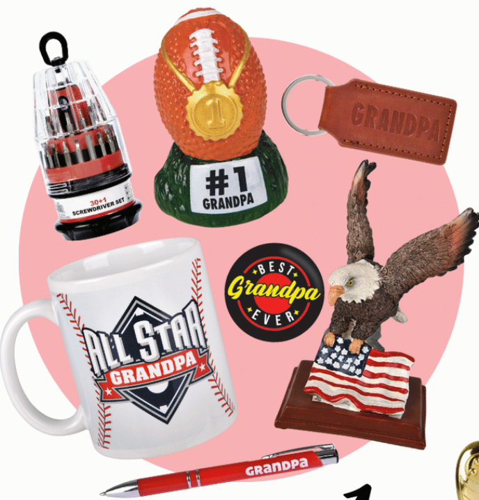
Gifts for Grandpa