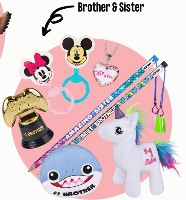
Brother & Sister