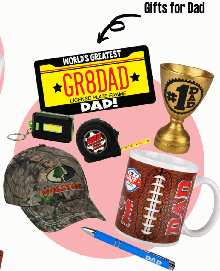
Gifts for Dad