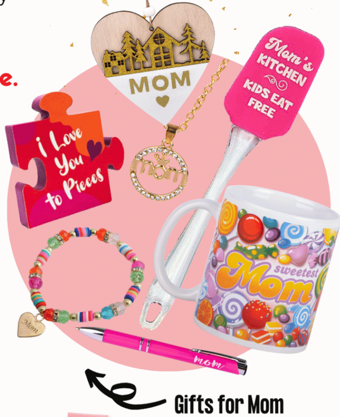
Gifts for Mom

Our Holiday Gift Shop offers unique & affordable gifts for everyone!